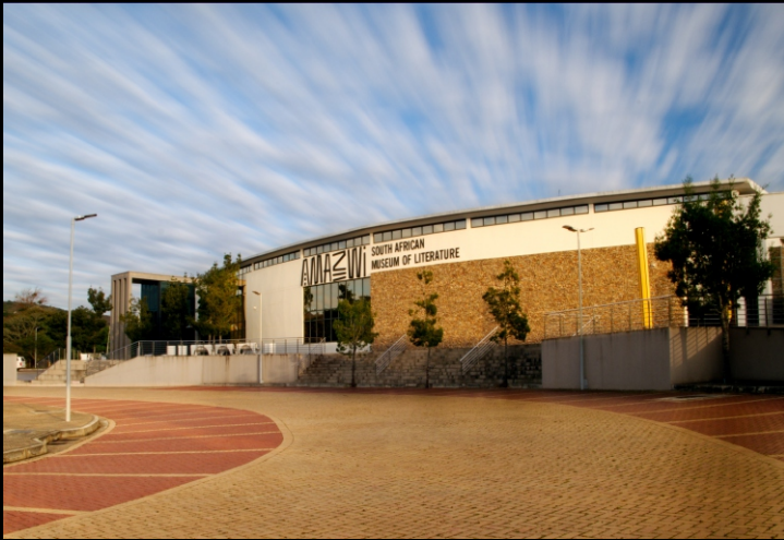
VERANDAH and PARKING